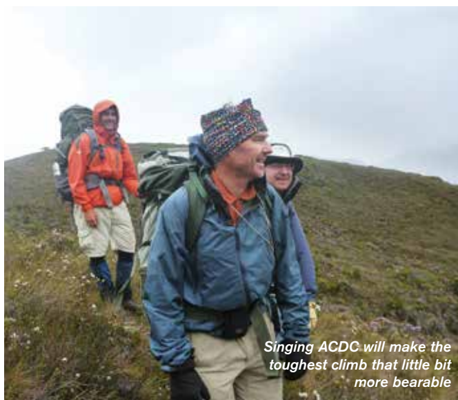
Singing ACDC will make the toughest climb that little bit more bearable

We negotiated several airy descents on the second last knoll towards the last knoll only to be met with the 30-metre cliff. When we saw it up close, we were petrified, almost physically sick. It was all we could do to bring ourselves to look over the edge. The wind had sprung up and it felt like one good gust would send us over the edge. We plastered ourselves against the back wall of a ledge and tried to compose ourselves. We worked up the courage to throw our rope over the edge to see what would happen. Well, the wind whips through the gap between the second and last knolls and the rope went horizontal. We couldn't even work out if it was long enough to get the bottom.