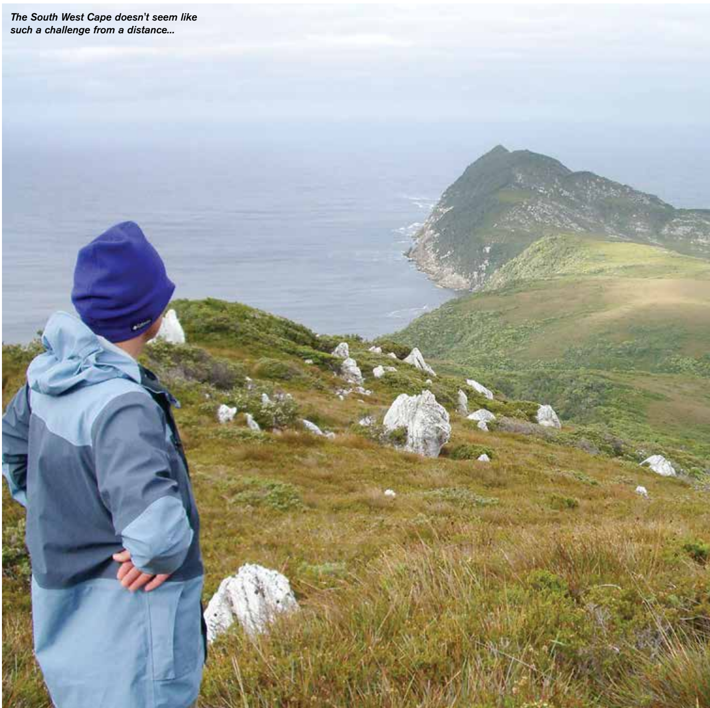
The South West Cape doesn't seem like such a challenge from a distance...

say we had conquered it. Indeed, it felt like the last knoll had conquered us. The familiar gnawing feeling was coming back. They say more people die on Everest coming down than going up and we realised we had a big task ahead of us getting back to camp. We'd already been on the track for nine hours. We were tired, scratched up, getting a lot of sun, hungry and fairly thirsty. We all eventually ascended the 30-metre cliff and flopped up onto the ledge exhausted. We proceeded to bash our way through the disintegrating forests of the cape.