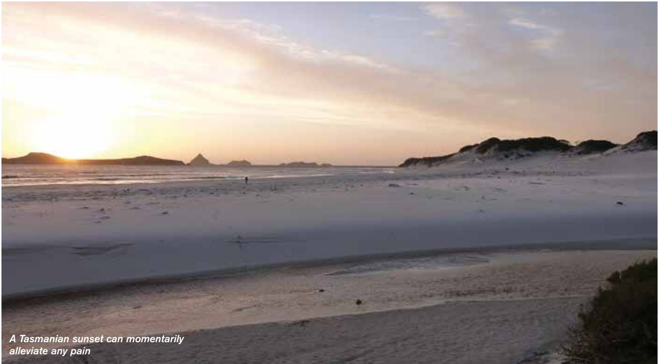
A Tasmanian sunset can momentarily alleviate any pain

adventure, with a series of significant obstacles: